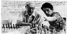
25. With GariK Kasparov